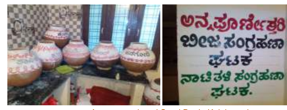
Annapurneshwari Seed Bank, Kalaburagi

The farmers are now conserving Black Paddy, Hamsa Paddy, Yellow and Green Gram, Jewe, Wheat, local Groundnut, Maldhandi Jowar, Foxtail Millet, Pink Dal, Sesame and local Green Gram varieties.