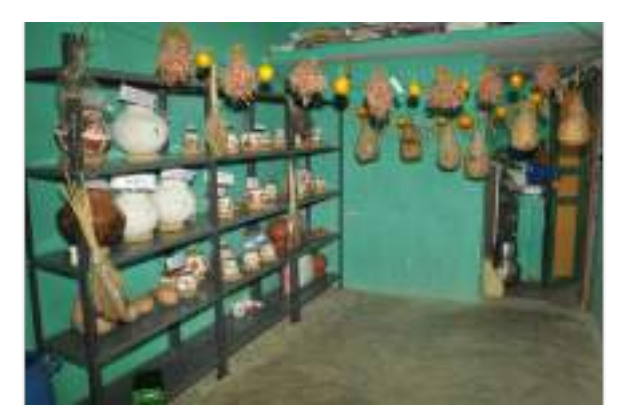
Magarantham Seed Bank, Pudukkottai

The Makarantham seed bank was inaugurated in Pudukkottai, Tamil Nadu. An orientation program was held for farmers from nearby villages in order to start the seed bank. They also had an exposure visit to Kanakapura. They are currently conserving 10 paddy varieties, 14 varieties of vegetables and 8 millet varieties.