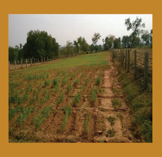
Stage 3: Germination