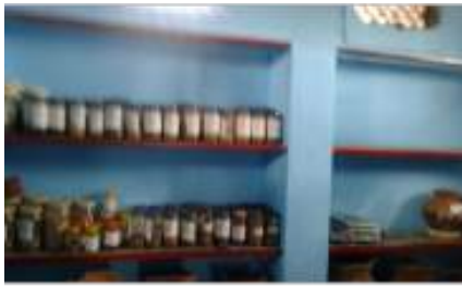
Guliganahalli Seed Bank, Kanakapura

The seeds conserved in these three seed banks are listed below: